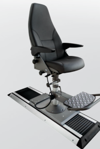
NorSap 800 - Art. No.: 6200

All sitting heights measures without load - a variation of 2-5 cm may occur depending on the load due to contraction of gas-struts, springs and upholstery. Does not apply the fixed height models. All fixed height columns can be cut to desired sitting height. The / indicates min. max cutting height. If nothing else is agreed, the chair will be delivered with black leather upholstery.