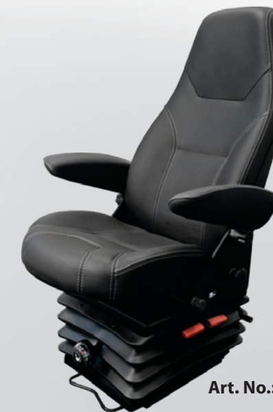
Art. No.: 6028

All sitting heights measures without load - a variation of 2-5 cm may occur depending on the load due to contraction of gas-struts, springs and upholstery. Does not apply the fixed height models. All fixed height columns can be cut to desired sitting height. The / indicates min. max cutting height. If nothing else is agreed, the chair will be delivered with black leather upholstery.