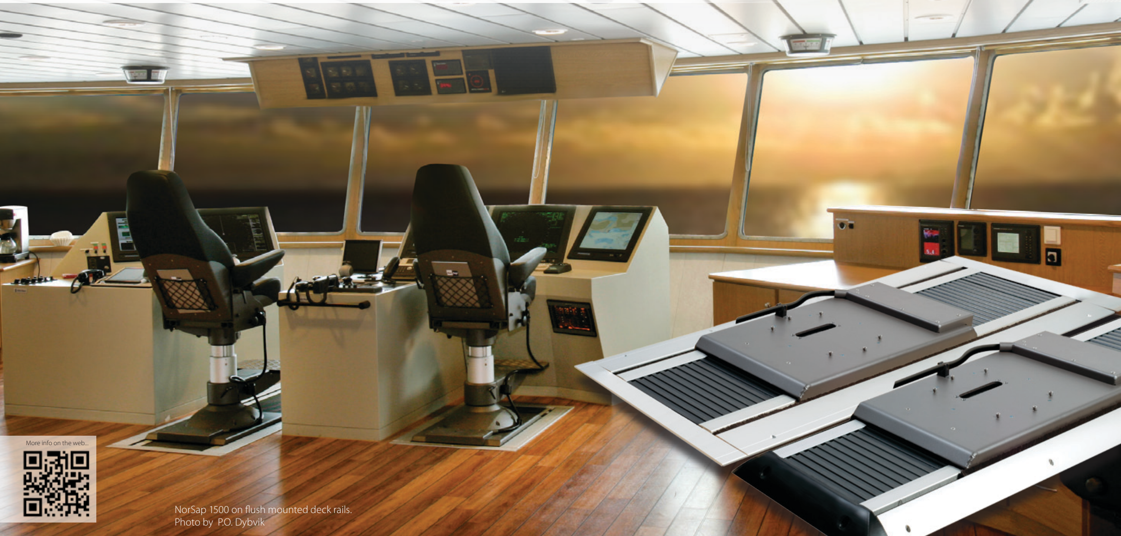
NorSap 1500 on flush mounted deck rails.

High quality deck rails designed for all kind of environments. Can be released and locked from sitting position.